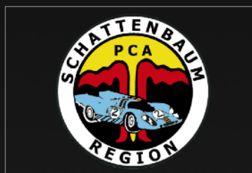
Porsche Tech Support Open techsupport@schattenbaum.org