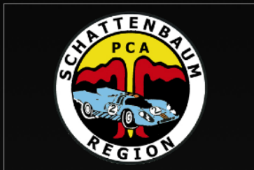
Autocross Open autocross@schattenbaum.org