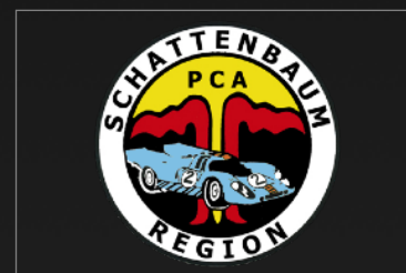
Webmaster Open webmaster@schattenbaum.org