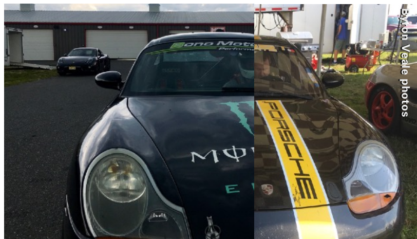
Byron Veale photos